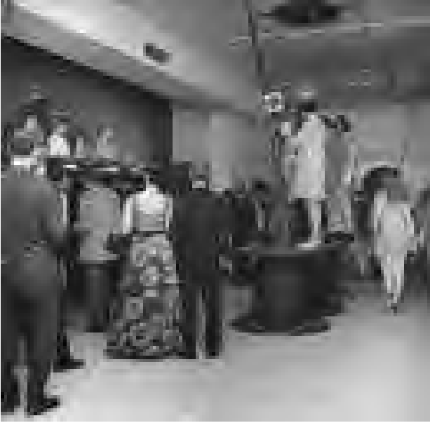
Fig. 4.10: Installation photograph of Otto Piene’s “party room” at the exhibition “Light/Motion/Space”, Walker Art Center, 1967.

one of ZERO’s original aims – as Piene claimed in 1964 – was to “[reharmonize] the relation between man and nature... using means of actual technical invention as well as those of nature,” by 1967, the world of “technical inventions” had begun to colonize “nature”, so that ZERO ultimately harmonized man with technology itself. (Recall Wise’s article in American Home : “In life today, our surroundings are mostly of our own making and it is the function of the artist to discover their beauty, to transform it, to order it, so that we may enjoy it.”) More than capturing the mere image of luminous New York, ZERO’s final works prepare us to “enjoy” the city’s media-saturated, thoroughly technolo-