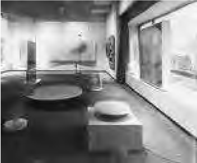
Fig. 4.3: Installation photograph of the Group ZERO exhibition, Howard Wise Gallery , November–December 1964.

“There is one integrating power which is and will be reigning in our efforts: the fascinating attraction of light.” 9