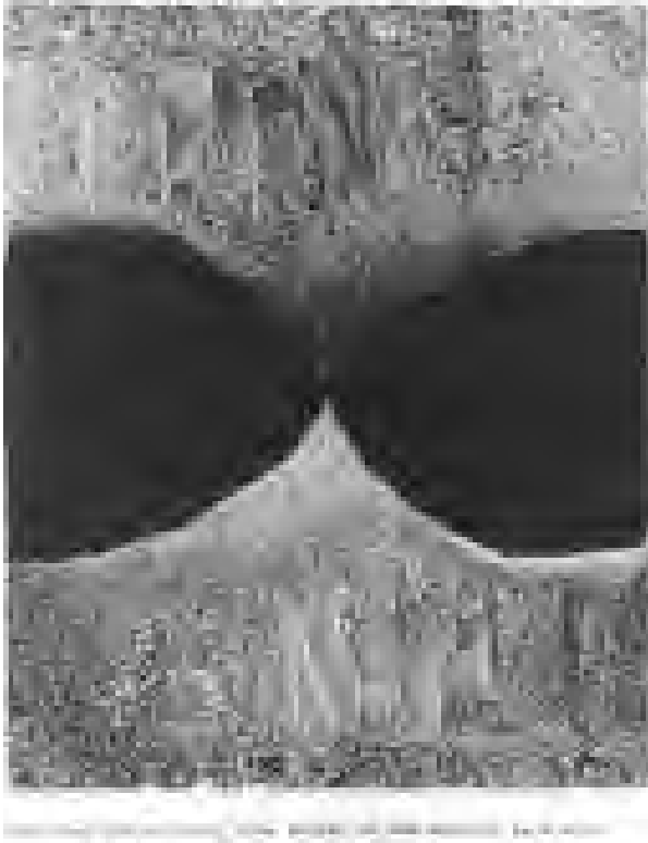
Fig. 4.7: Otto Piene, New York City on a Hill , 1969.

and shadows to working with mere metaphors or representations of lightness and darkness.) The same explicit invocation of mundane reality marks Piene's 1966 play, The Light Auction Or New York is Dark , staged at Frankfurt's Municipal Theater: The title, like the play itself, was a topical reference to New York's infamous blackout of 1965. 17 Finally, one may cite Piene's mul-