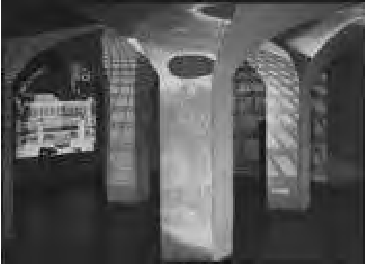
Fig. 4.8: Installation photograph of Otto Piene, New York, New York , 1967, Museum am Ostwall, Dortmund, Germany.

timedia installation New York, New York , which was staged in 1967 at his retrospective at the Museum am Ostwall in Dortmund, Germany, and attempted to use projected photos, such as the image of a taxi cab, and recorded ambient sounds to convey the experience of being in the city (Fig. 4.8). In all of these works, ZERO's typically abstract use of light to suggest universal ideals becomes allusive and historically specific; one might say New York transformed ZERO's aestheticized and utopian light into something relatively crude and quotidian. 18