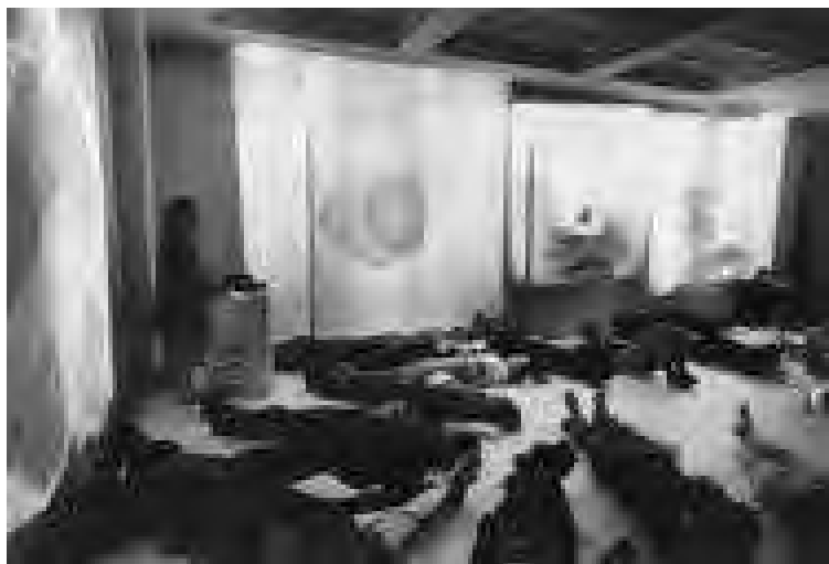
Fig. 4.9: Otto Piene, The Proliferation of the Sun , March 1967, Black Gate Theatre , New York City. © Estate of Peter Moore / VAGA NYC 2013.

around the room as the audience sat on the floor. The program notes given to the audience included Otto's description of his presentation, and I wrote a series of philosophical statements such as "blackout – man does not need his eyes but to function with 13 billion cells in his brain." 31