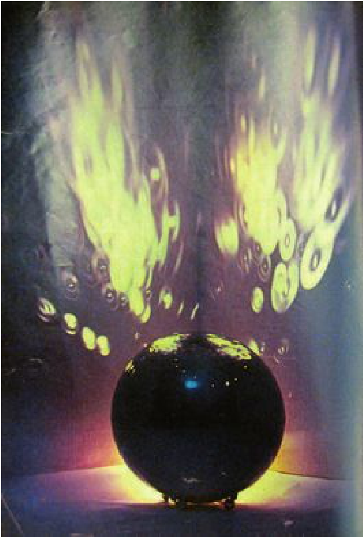
Fig. 4.1: Otto Piene, Light Cocoon , 1965. Illustration accompanying the article "Light Becomes the Medium", American Home , October 1969.