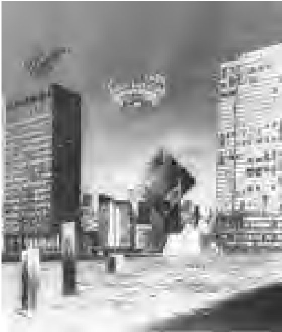
Fig. 4.5: Heinz Mack, Die unerwartete Begegnung, New York ( The Unexpected Encounter, New York ), 1963–73.