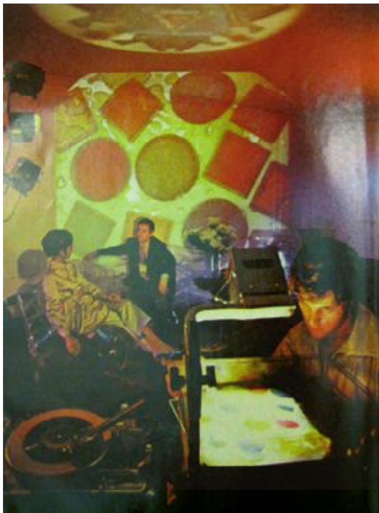
Fig. 4.2: Illustration accompanying the article "How to Toss a Light and Sound Party", American Home , October 1969.