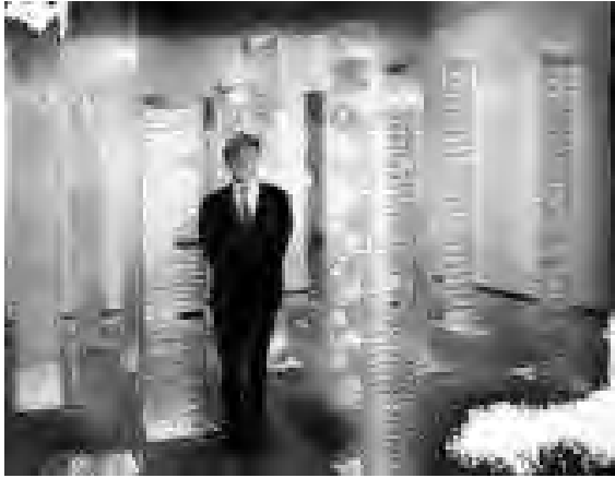
Fig. 4.4: Installation photograph of the Heinz Mack: Lights of Silver exhibition, Howard Wise Gallery, 1966.

spangles of embossed aluminum mounted in wall boxes, suggest the shimmering light patterns of the Great White Way [a nickname for Broadway]. A cluster of glittering pylons, arranged in skyscraper ranks, make ingenious use of stainless steel, Plexiglass, polished aluminum, mirrors, and – yes, diffraction lenses. And they could be a backdrop for “42nd Street”. 16